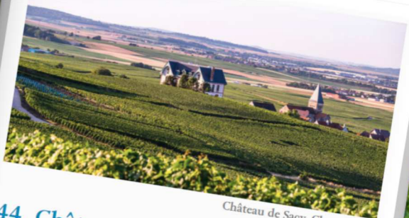
Château de Sacy, Champagne.