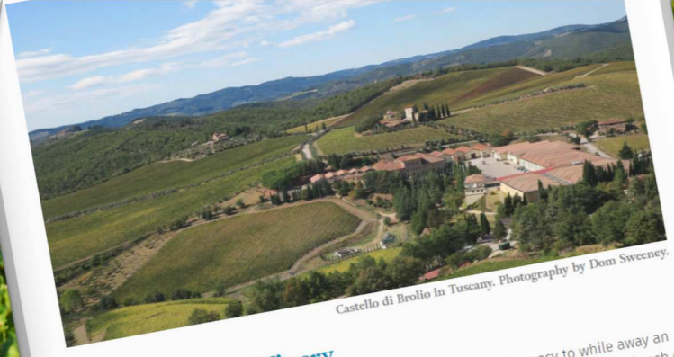
Castello di Brolio in Tuscany.

» TIP: There's even a spa! chateaudesacy-reims.fr