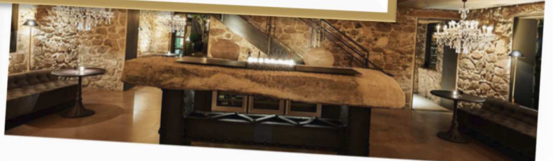
RH Wine Vault.

» TIP: Patagonia produces stunning pinots in the Rio Negro region so be sure to try some. lirawineexperience.com